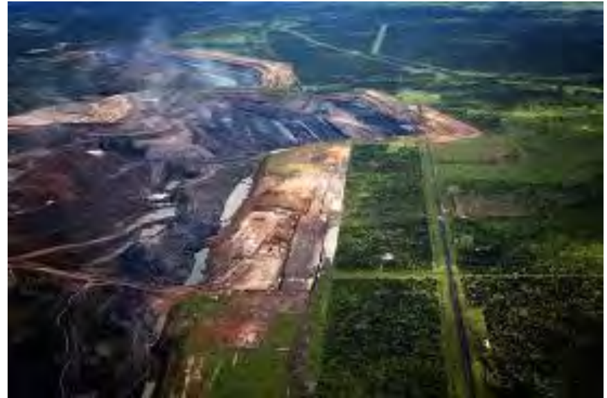
Galilee Basin coal project