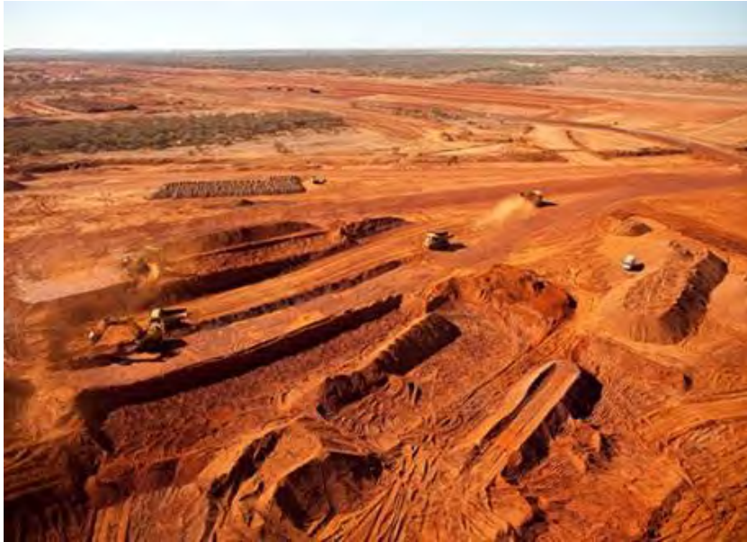
Roy Hill project